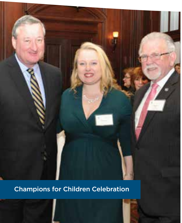
Champions for Children Celebration

For more information about sponsorship opportunities or registration for any of CORA's events, please call Institutional Advancement at (215) 701-2536 or email Caring@coraservices.org .