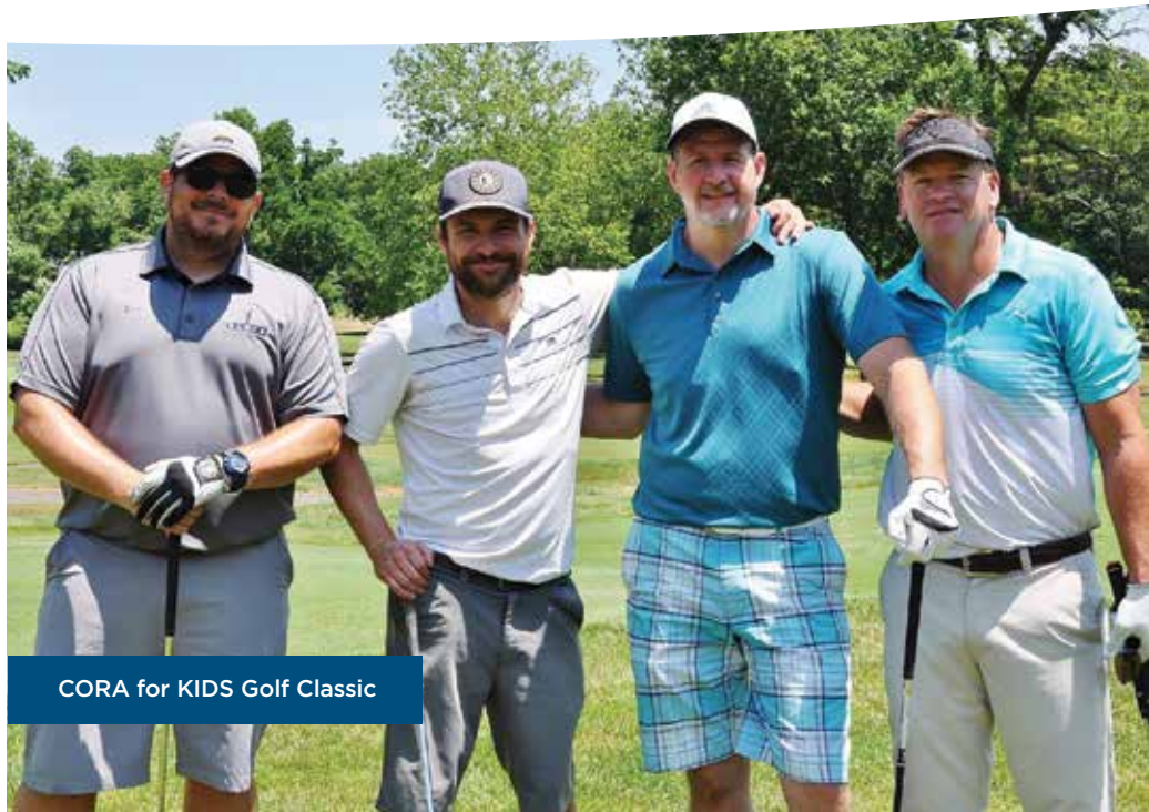
CORA for KIDS Golf Classic